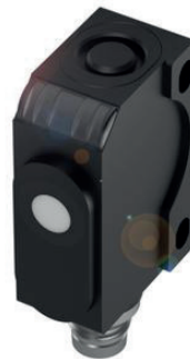
Ultrasonic sensor for detecting levels – without contact – even over longer distances

Various technologies can be used for detecting level depending on the application area: