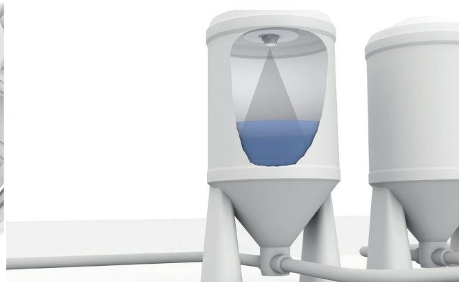
Ultrasonic sensors check the fill height of tanks.

Capacitive sensors reliably detect the level of granulate in a container. To accomplish this, two sensors are attached in the container offset from each other. A signal is generated when the minimum or maximum level is exceeded. This prevents over-filling or falling of the level below a prescribed value, and reduces equipment downtime. Capacitive sensors are designed for flexibility and are simple to install.