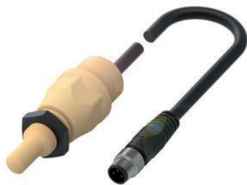
Capacitive sensor for detecting levels – with or without medium contact – at close range

Ultrasonic sensors detect the precise fill height of a tank without contact. They ensure that the filling process can run continuously. Ultrasonic sensors are also reliable over greater distances and require no additional component such as reflectors.